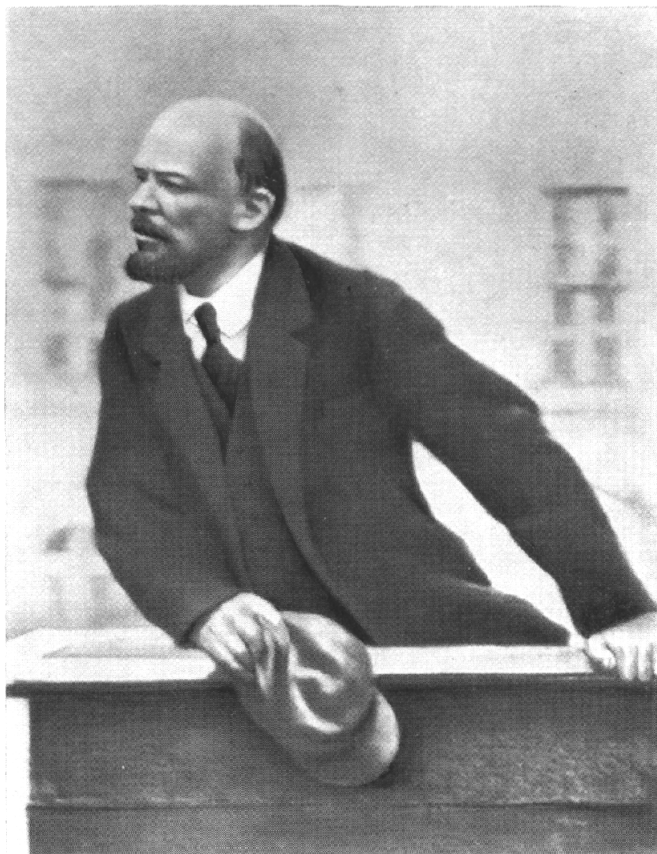
V. I. L E N I N May 1920