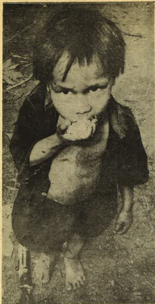
ESTA ES LA "LIBERTAD" que el gobierno de EEUU quiere traer a Vietnam.

DEMANDAMOS PONER FIN A LA GUERRA EN VIETNAM. TRAER LAS TROPAS A CASA.