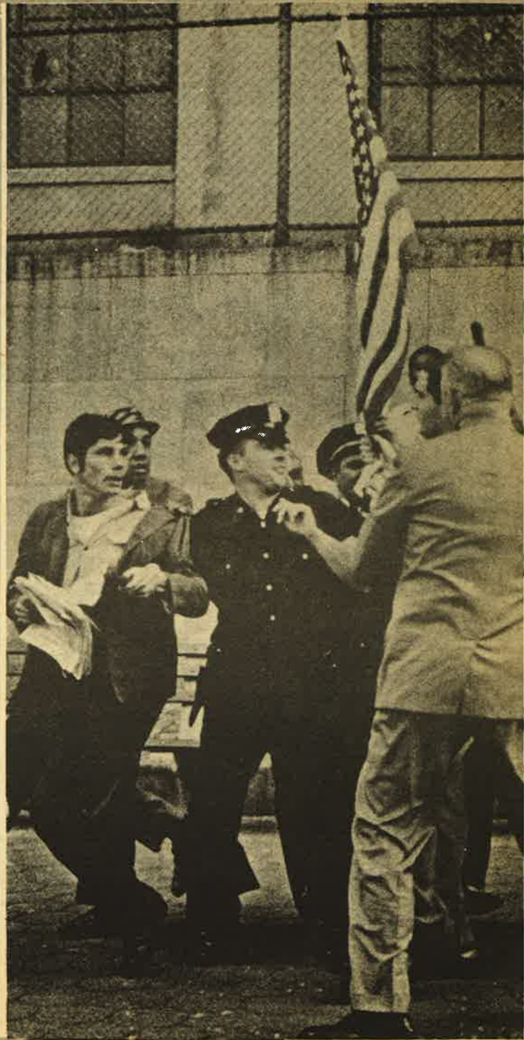
POLICE ASSAULT STUDENT demonstrator du bombing of north Vietnam, last August. Much of the depends on their ability to suppress dissent at hor State war plans, a McCarthyite "Grand Jury" ha people active in protests against government policy in of black people in the U.S.A. One young co-ed is in with the "Grand Jury" in halting opposition to the Vie

END THE WAR IN VIETNAM. BRING THE TROOPS HOME.