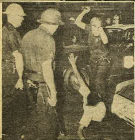
VIETNAM, CONGO, HARLEM... it's all one fight.