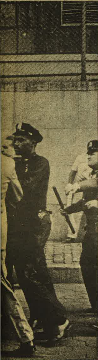
ing protest against the U.S. government audacity abroad. The Army and arm with United subpoenaed about 25 young Vietnam and the suppression jail for refusing to cooperate in the war.