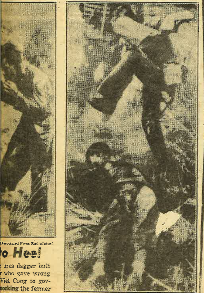
to Heel uses dagger butt r who gave wrong Viet Cong to gov- locking the farmer eded to work him right . . .

IF THE US Army enlarges the war it will find opposition everywhere. Cambodia has announced it will call in Chinese troops. More than two-thirds of Laos is controlled by the Communist-led Pathet Lao. In Thailand there are rebel groups controlling a number of provinces. The Vietcong controls 90 percent of south Vietnam. ASIAN PEOPLE UNITE TO OPPOSE US RULERS!