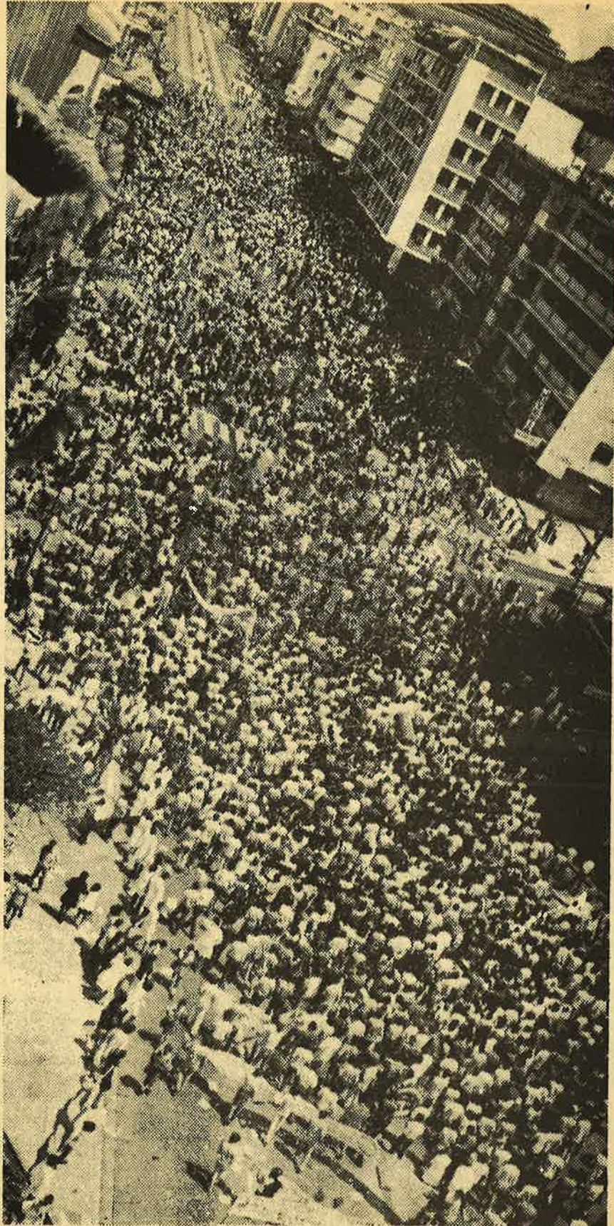
VENEZUELAN STUDENT PROTEST....

McGovern's foreign policy would keep workers enslaved in countries like these.