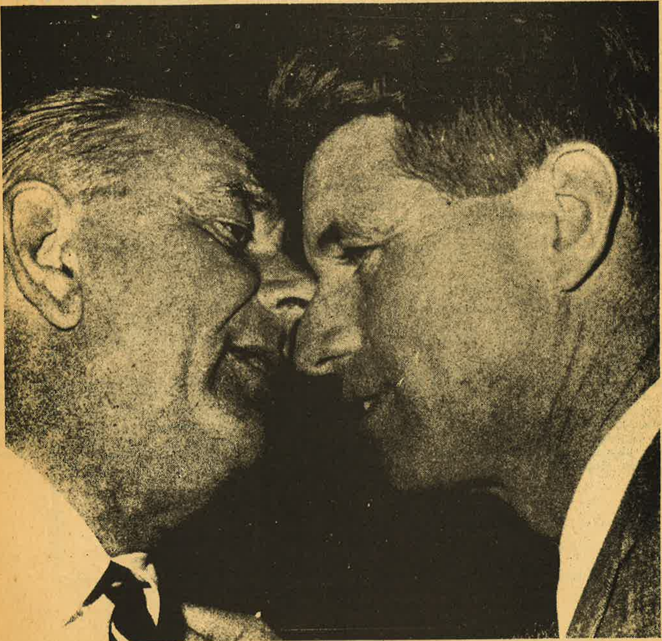
A couple of veteran "lesser evils..."

But we can win. We can win because we are the many and they are the few. We can win because billions of people in every corner of the world need socialism as much as they need air to breathe. Nothing can stop class-conscious workers on the road