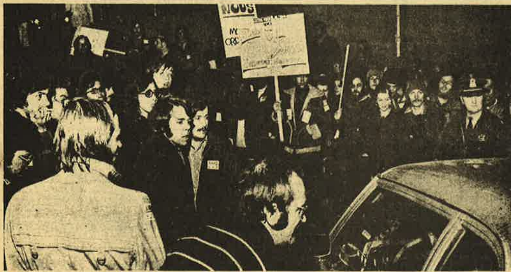
WORKERS TAKE OVER.... Quebec general strikers halt Montreal cops at Notre Dame Hospital picket line (above) while police car (right) shows effects of working-over disbed out by Sept-11es strikers in province-wide walkout in April. Sept-11es workers seized the city and jailed the cops (see pp. 12-13). This kind of unified, militant action broke the bosses' racist and nationalist divisions and propelled all workers further along the road to LASTING power--Socialism.

New York Hospital Workers' Goal: UNITE AND STRIKE!