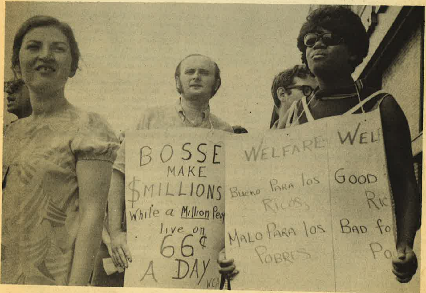
McGovern's "new plan" for welfare is just like the sign says: "Good for the rich...Bad for the poor..."

..... as much as $92 billion in additional revenue to the Treasury... This Income Redistribution plan could replace welfare; middle income taxpayers ($4,000 to $12,000) would be eligible to receive from the Federal government an income supplement. The proposal is not limited to any single formula. The annual payment might be as much as $1,000 per person or $4,000 for a family of four.