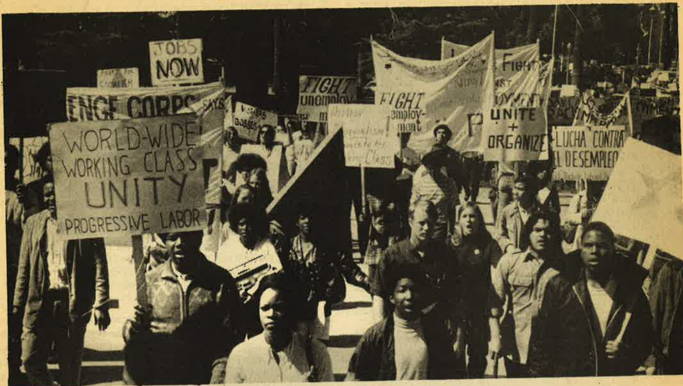
What campaigns like McGovern's tries to contain and prevent

as Nixon increases the bombings and minings, he continues troop withdrawals.