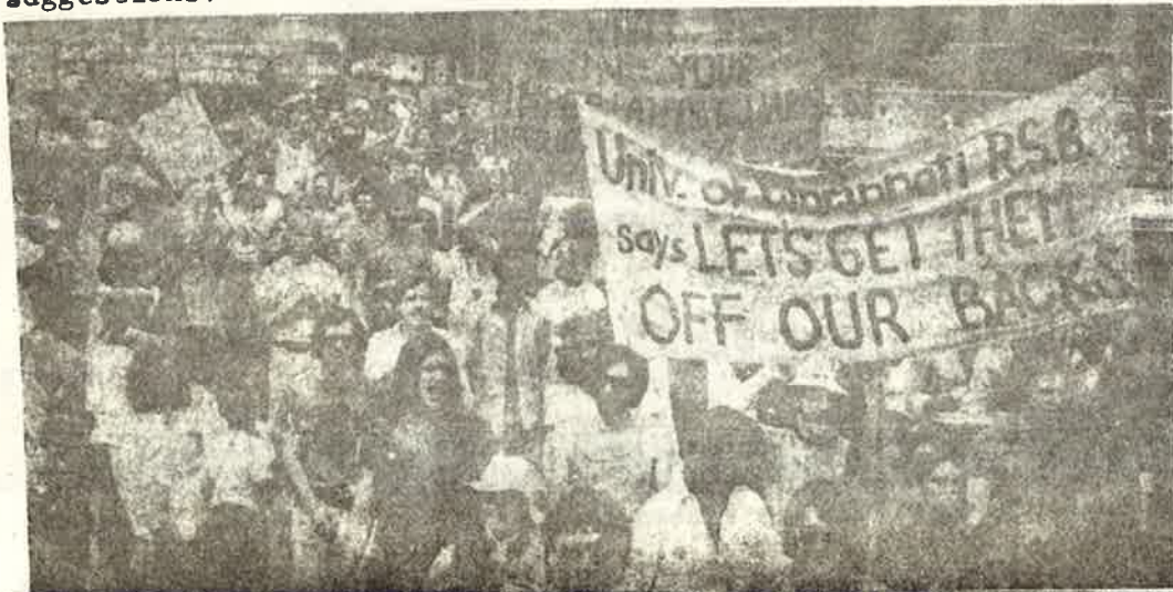
R.S.B. contingent in the July 4th march in Philadelphia.

The Revolutionary Student Brigade uses Marxism-Leninism and the thought of Mao Tse-Tung to understand and change the problems we face at home and abroad. Based on over 60 campuses, the Brigade has organized thousands of students to oppose cutbacks in education and U.S. aggression, and played a major role in building for the "Rich- Off Our Backs" July 4th demonstration that took place in Philadelphia. Here in Ann Arbor, we have had a chapter of the Brigade for 3 years, and have been active in work to kick the CIA off campus, to rollback tuition hikes, and to support workers' struggles. We think that there's a lot that can be done, and we encourage all students, old and new, to check us out, to work with us, and to bring us your suggestions!