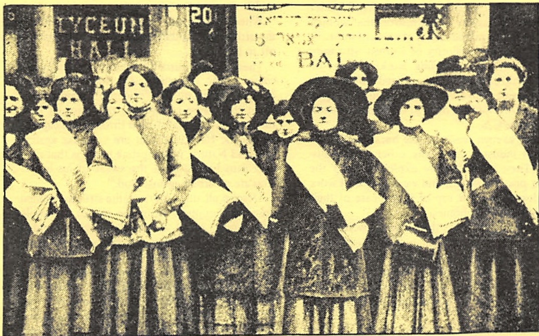
1909 garment workers' strike sparked mass struggles of women against their oppressive working conditions.

March 8th is International Working Women's Day. It is a day to commemorate the history of struggle for women's liberation and to express solidarity with revolutionary women around the world. The historical origin of International Working Women's Day was the great struggle of tens of thousands of women garment workers in this country who, in 1909, stood up in collective and militant struggle against class exploitation and women's oppression.