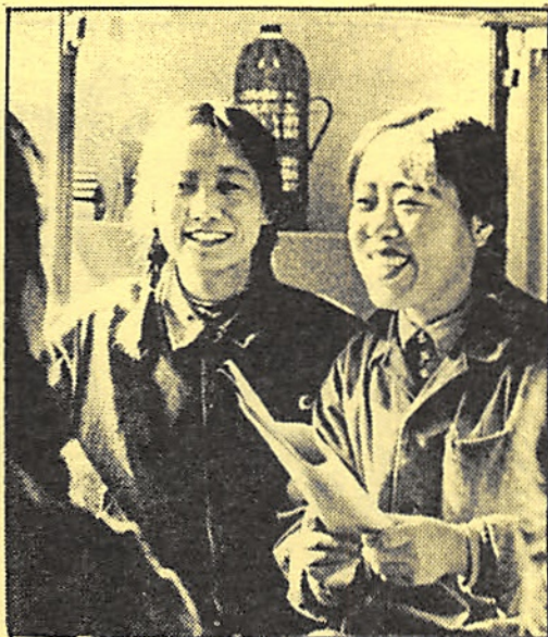
Women workers in China organize spare-time study groups.

Workers must fight for the well-being of women. Demands for special protection of women workers such as weight regulations for