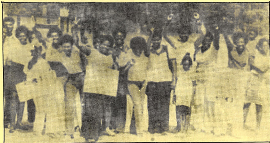
Textile workers at Oneita Mills in South Carolina fought to unionize.

Women comprise half of humanity, yet in all but the socialist countries of the world, women are severely oppressed. In capitalist countries worldwide including the United States, women toil for low wages and under bad conditions. In the homes, women are forced into dependence on men and are solely responsible for the raising of children and housekeeping. Socially, women's status is unmistakably lower than men's, and politically women are denied many basic rights.