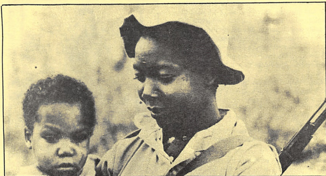
Women participated in every aspect of Mozambican liberation struggle.

masses into direct conflict with the capitalist system and the monopoly capitalist class. Firm class unity must be forged in the struggle for socialist revolution, which is the only path to fighting all oppression of women. Fighting for the demands of women is a component part of the socialist revolution and will draw increasing numbers of women into the revolutionary movement as active participants.