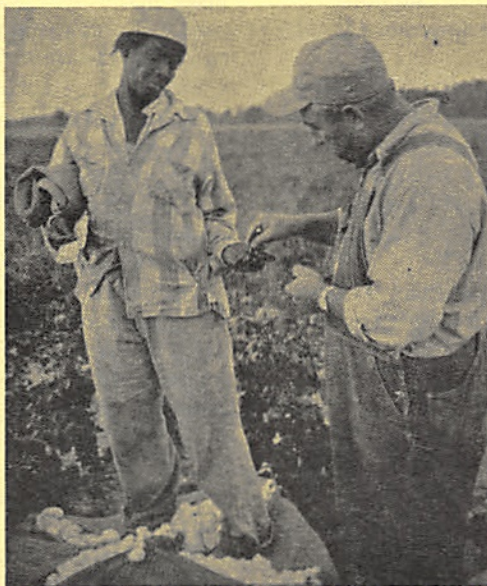
Black women in the South are superexploited and oppressed.