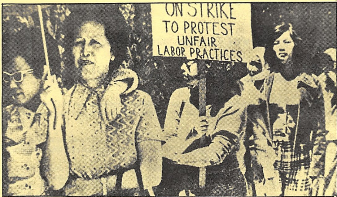
San Francisco Chinese garment workers struck at Jung Sai in 1974 against Chinatown sweatshop conditions.

I know. When the Japanese invaded China, it was the Kuomintang (KMT) who pushed our faces into the mud and trampled over our hungry bodies. But the Communists, they truly loved the Chinese people. I saw them, they changed everything. When people ask me, I say, "Yes, I like the Communists! Look at what they have done for the Chinese people! I, as a woman who grew up in feudal China, I know the changes that have been made!"