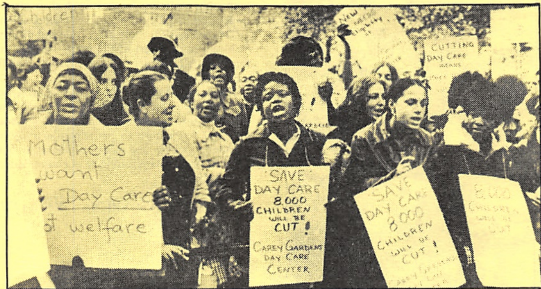
Working women all across the U.S. have taken up the struggle for childcare.

Because of the glaring lack of facilities, many mothers sign long waiting lists as soon as they become pregnant, hoping that by the time the child is of age, a space will be available. Unfortunately, by the time the space is open, the child is usually too old.