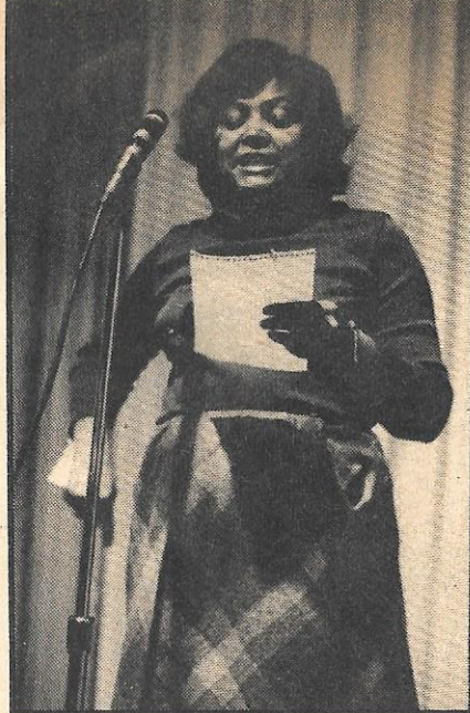
PUERTO RICAN woman speaks on El Clarin at Boston meeting.

—Portland, Ore., supporters raised $1,100 with a people's auction, $500 of which was donated by one worker.