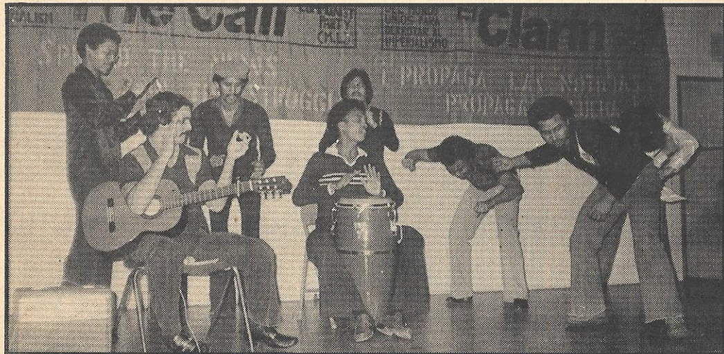
TERPSICORE, a group of Dominican singers, performed at New York Call gathering.