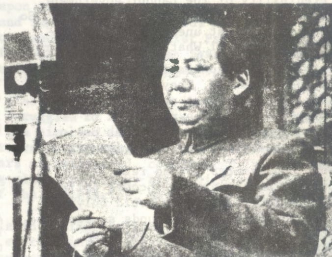
October 1, 1949: Chairman Mao Tsetung announcing to the world the founding of the People's Republic of China.

JOURNAL OF THE NATIONAL COMMITTEE OF THE COMMUNIST FEDERATION OF BRITAIN (MARXIST-LENINIST)