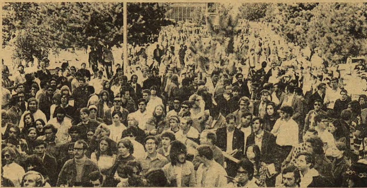
S.F. State Strike -- students march on Administration Building