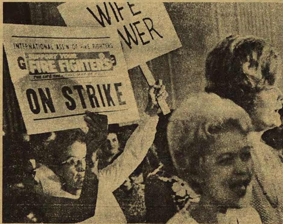
Clippings from Chicago Sun-Times show bosses' attempt to divide these militant women from their husbands

On Aug. 4, an estimated 40 firemen's wives set up a picket line around the central fire station in downtown Gary. They kept the station's trucks from rolling and made an engine from another station detour on its way to a fire.