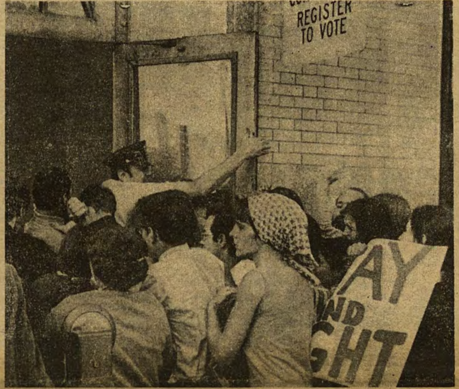
many others), large universities are helping kick working people - especially Black people - out of their homes to make way for big business and government research. SDS opposes these racist attacks on working people around the country.