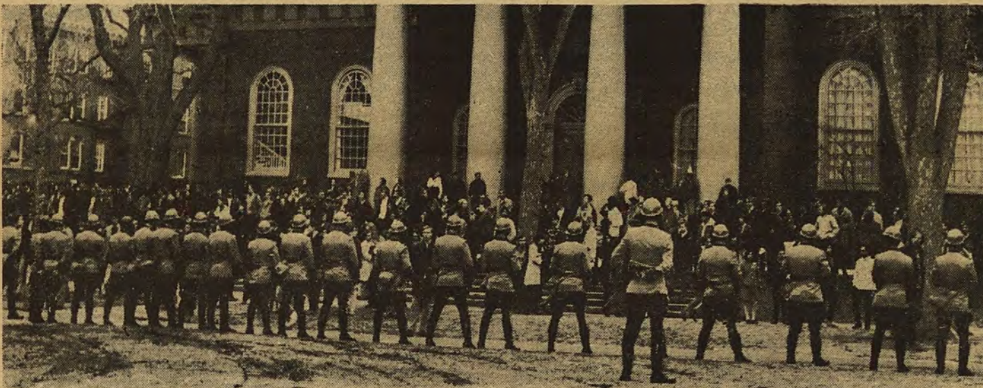
Liberal Harvard calls cops in attempt to save ROTC

The exploitation of campus employees at the University of Maryland is not an isolated situation. All working persons constantly face lousy conditions so that the bosses can make more profit off of their labor. The U of Maryland serves as a stinging reminder to all of us that not enough is being done on the part of students to fight against the bosses. The campus is a stronghold for the bosses' power. We must build long-range alliances with campus workers to break down that stronghold.