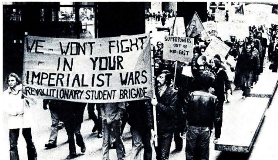
RSB contingent leads Chicago April 19th march

ued with a spirited rally following the march.