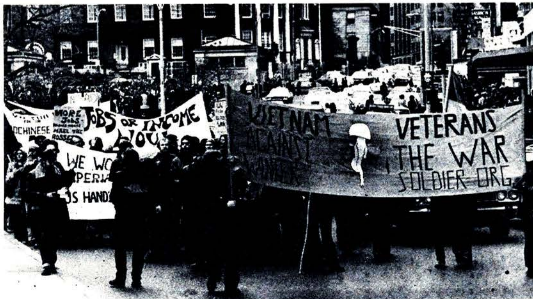
Hundreds demonstrate for Viet Vets Day in Boston

Elsewhere in the country, VVAW/WSO in Oregon made a limited incursion into the Portland VA hospital. VVAW/WSO is just beginning to organize in Portland and this action consisted of members handing out newspapers and leaflets which were met with great enthusiasm from patients, hospital workers and some doctors who supported their demands. One vet told the VA officials, "We're here as part of the 'War on the VA.' Vets are fighting against the rotten conditions at VA hospitals all over the nation and we're opening a new front here!"