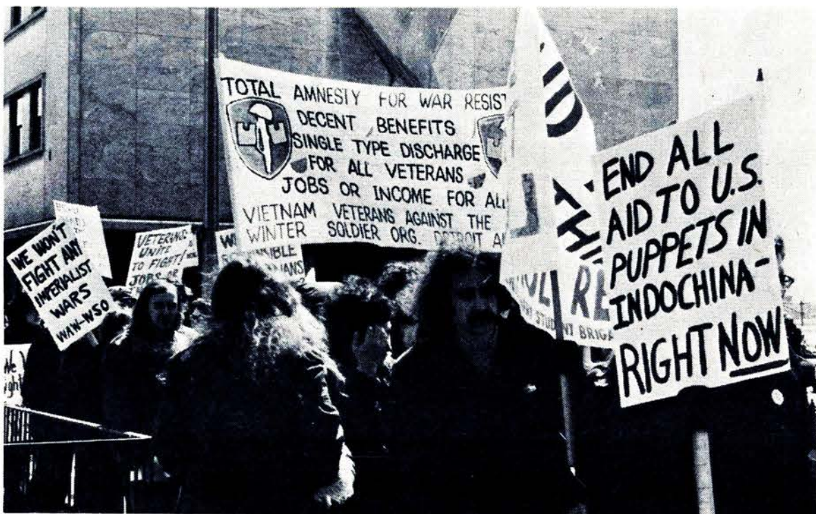
DETROIT DEMONSTRATORS ASSEMBLE AT VETERANS MEMORIAL BUILDING

The US Army was out to "celebrate" their 200th anniversary on April 6th with a parade in downtown Detroit. The ruling class just couldn't wait to kick off their bi-centennial events; and a kick-off is exactly what they got. The Detroit chapters of VVAW/WSO and the Revolutionary Student Brigade (RSB), organized a militant counter-demonstration raising the demands, "We Won't Fight Any Imperialist Wars," "End All Aid to Thieu and Lon Nol," and "Superpowers Hands Off the Middle East." Other slogans, banners and picket signs put forward demands for "Decent Benefits for All Veterans," "Total Amnesty for All War Resisters," "No Tuition Hikes," and "No Cutbacks in Education."