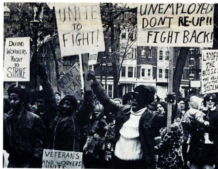
Vets contingent in Cincinnati UWOC Demo

By the time the march ended, another 50 people had joined in with it. At the march, a VVAW/WSO member spoke about the need to tie the demand of "Jobs or Income" to the demand "We Won't Fight Any Imperialist Wars!" The speaker pointed out that "they try to tell us that a war is what we need to give us jobs. But we know that, like Vietnam, it'll be a 'rich man's war, a poor man's fight.' We say we won't fight another rich man's war in Vietnam, in the Middle East or anywhere else!"