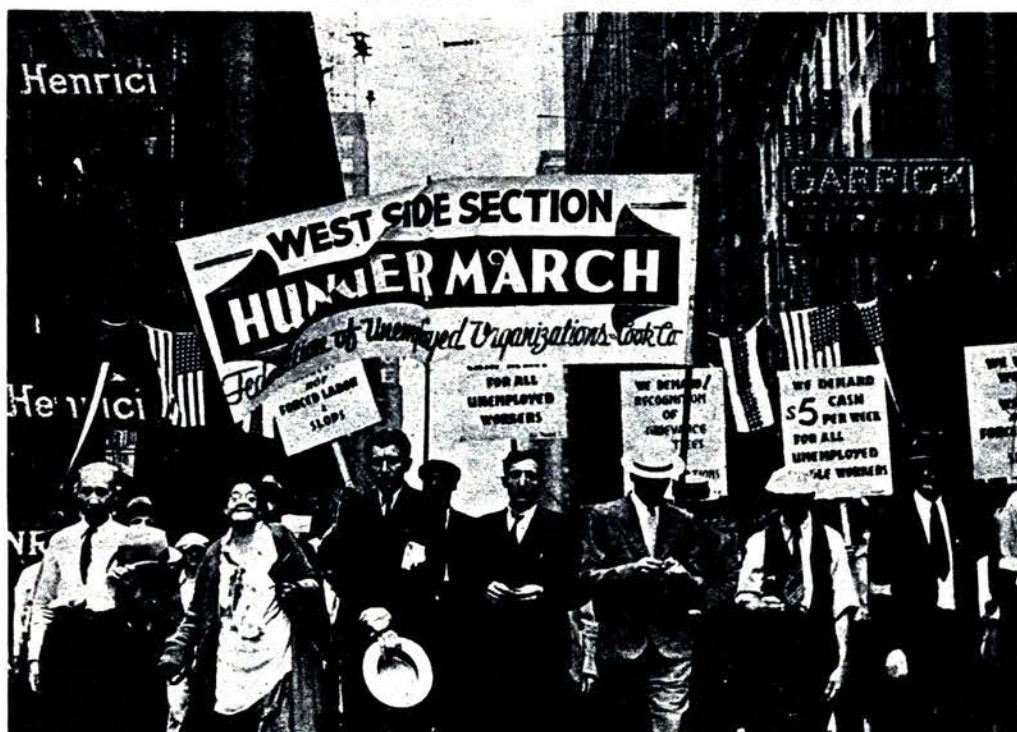
Unemployed workers demonstration in Chicago, 1932