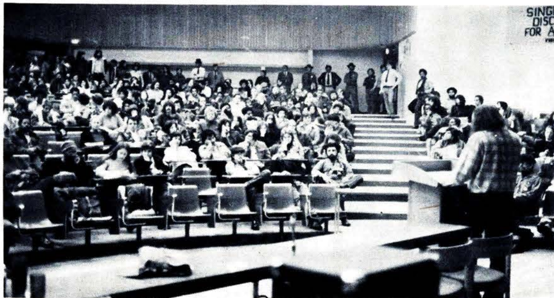
VVAW/WSO Forum on Middle East at Old Westbury, N.Y.