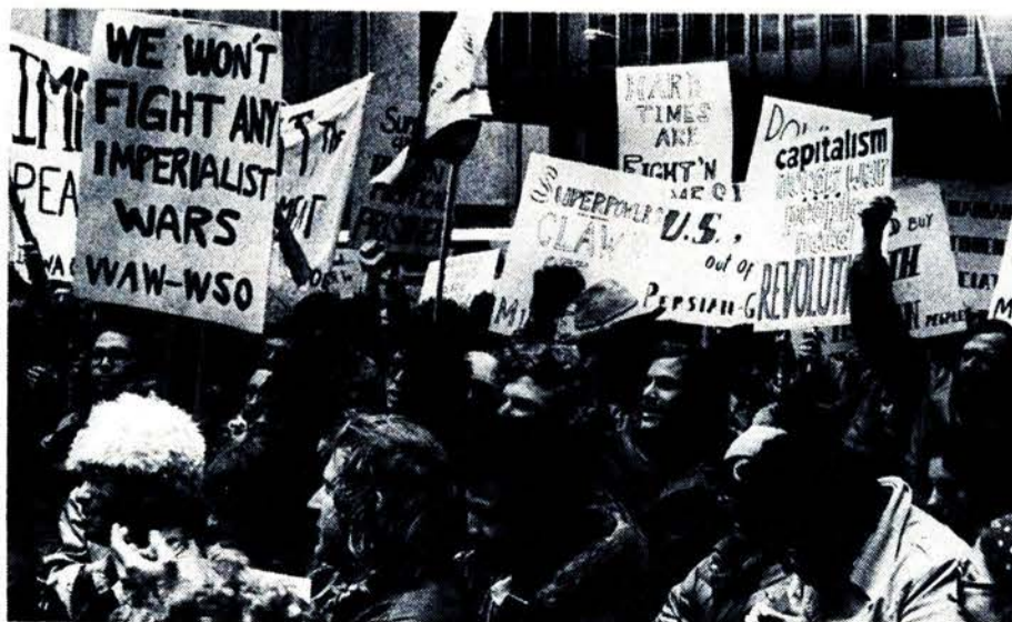
Rally at Chicago RSB demonstration

For more information on the Revolutionary Student Brigade, contact: RSB National Office, P.O. Box A3423, Chicago, Illinois 60690.