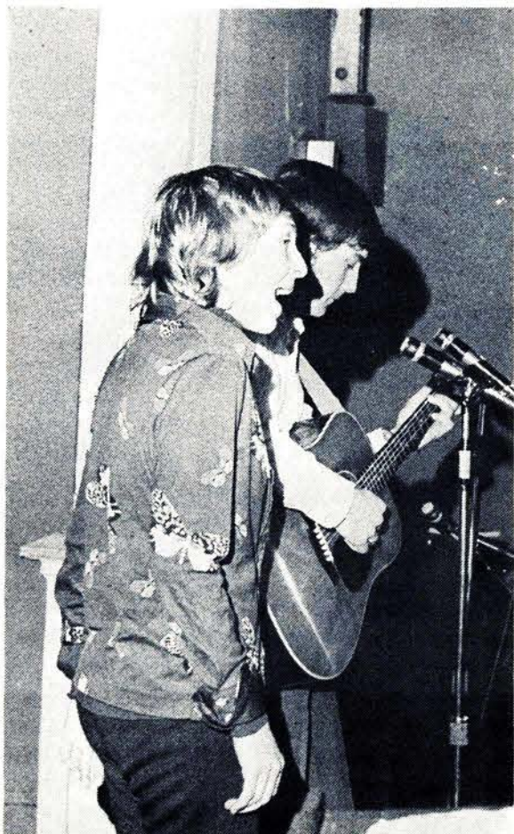
Chicago Prairie Fire Concert

Since February, Prairie Fire, a revolutionary musical group from the San Francisco Bay Area has been on a national tour, sponsored by the Revolutionary Student Brigade and Revolutionary Union. Though musical groups tour the US all the time, there is a big difference between most other groups and Prairie Fire. In the first place, Prairie Fire is a working class couple; when they aren't performing, they're working in factories. In the second place, the music which Prairie Fire is taking out to people all across the country is music which has grown out of the daily struggles being waged against oppression and exploitation the world over. Not only do their songs expose the nature of the imperialist system -- a system which is based on making profits for a small