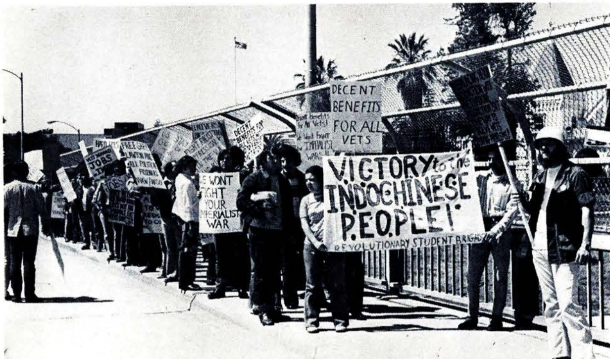
Demonstrators near Westwood VA in Los Angeles

Vietnam Veterans Day was concocted to "honor" the GIs who fought against the people of Indochina. But it's a sham "honor." It's no honor to fight an imperialist war and it's no honor to live in a system that exploits and oppresses not only people in the US, but people around the world. It's no honor to be unemployed or to have rotten health care. And it's no honor to be used by society to fight in wars of aggression and then be shoved aside by a society that can't meet the needs of its people. Vets and non-vets joined in these demonstrations to expose this sham. They joined their united voices and actions to direct one more blow at the system causing the wars, the exploitation and the oppression--the system of imperialism. More and more people are daily adding their voices to this fight--a fight that will be won when the imperialist system is finally wiped out once and for all!