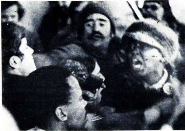
Vets fight mace in Milwaukee

Chants such as "Look out VA, This is a Bust; Decent Benefits are a Must," "Thieu gets Billions, Vets get Crumbs; Organize to Fight the Bums," and "Come on People, Stand up and Fight, Jobs or Income is our Right!" rang out in cities across the country as VVAW/WSO chapters took to the streets on "Honor Vietnam Veterans Day."