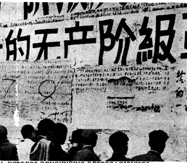
POSTERS DENOUNCING RESTORATIONISTS.

travelled extensively in China recently reports: