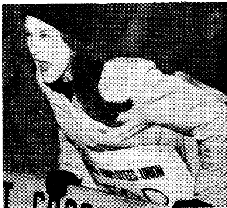
STRIKER SHOUTS AT SCAB CROSSING PICKET LINE.