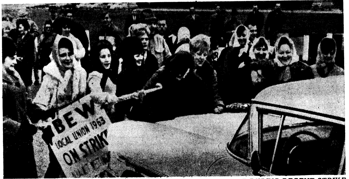
WESTINGHOUSE WORKERS STOP CAR CRASHING PICKET LINE DURING RECENT STRIKE.

Workers should pause to consider the disastrous setback to the standards of work and living they enjoy as a result of years of labor struggle if this goal of the employers is