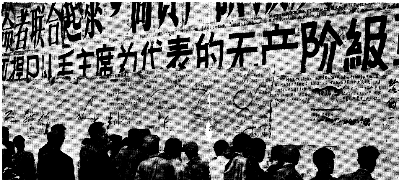
PEKING WORKERS READ RED GUARD WALL POSTERS DENOUNCING RESTORATIONISTS.

It is not clear to what extent this opposition consciously holds Liebermanist views on competition within the economy, material incentives, etc. It does seem quite likely that these views are widespread within the opposition. In any event the factor which has given cohesion in this opposition is -- the Red Guards. It is the revolutionary initiative of the youth which has frightened the conservative administrative bureaucracy of the CCP and of the Chinese state, which has panicked it into an open opposition and struggle unparalleled in the whole history of