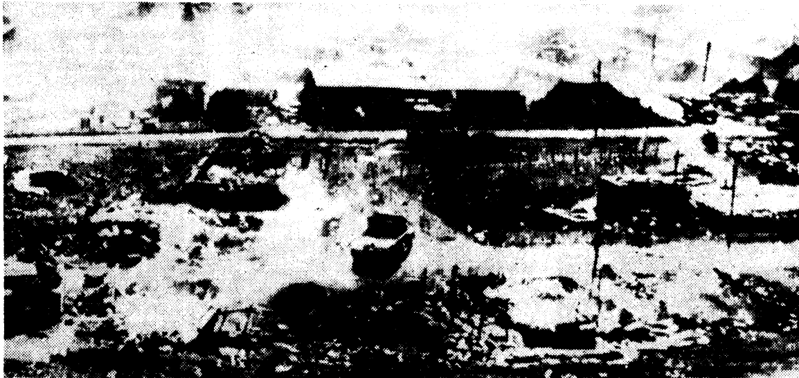
VIETCONG DRIVE U.S. IMPERIALIST AGRESSORS OUT OF THE VILLAGE OF KHESAN

As the Vietnam war heads for a major military battle around the Khesanh area, a new threat of war looms in Korea over the Pueblo incident. A look at the map makes the significance of this clear. As American military might is developed to the South in the Vietnamese peninsula moving ever closer to the borders of China. The United States utilizes the Pueblo incident to build up its forces in Korea to the North of China.