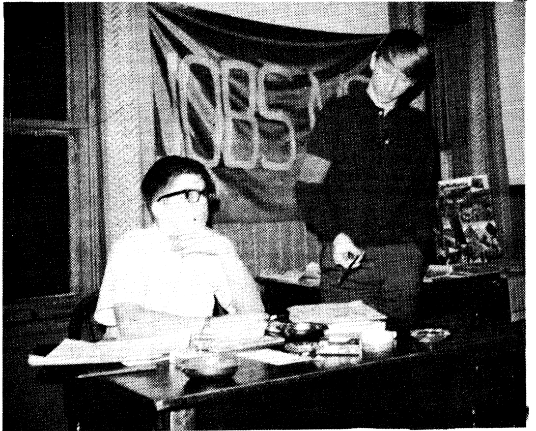
TWIN CITIES YWL HOLDS FIRST PUBLIC MEETING see page 4

AGAINST . rotten schools . no jobs . the draft . racism FOR . POWER