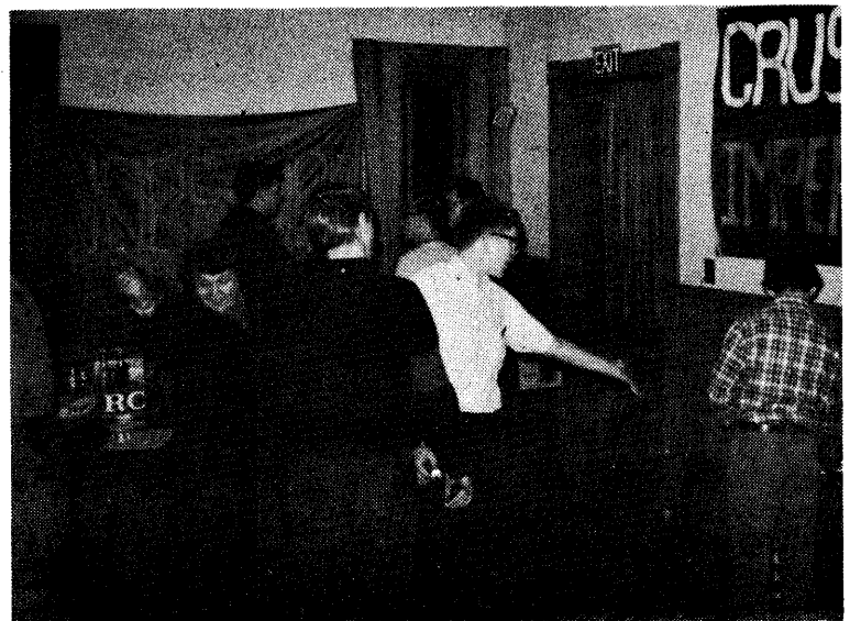
DISCUSSION AFTER FIRST YWL MEETING IN TWIN CITIES

During the intense discussion after the formal reports, plans for YWL activities were formulated. Comrades would travel to Chicago on Jan. 27 and 28 to intervene in the Student Mobilization Committee Conference, and work toward a second public meeting on Feb. 14, as well as campaigning intensively at factories and high schools for the Trade Unionists for a Labor Party meeting on February 4.