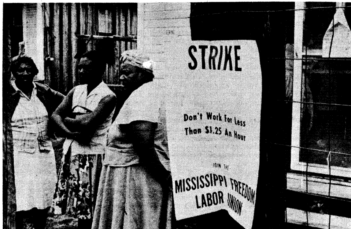
FARM LABORERS IN MISSISSIPPI MUST STRUGGLE FOR MINIMUM WAGE

We also are not going to stand idly by while black and white youth in the high schools slug it out making the bosses and the government happy for they know full well the power of these blows if they were directed against them instead of dissipated by youth fighting youth. The way we see it only a program which unites youth in a common struggle can break through these divisions. This is what we have and this is what we are going to fight for.