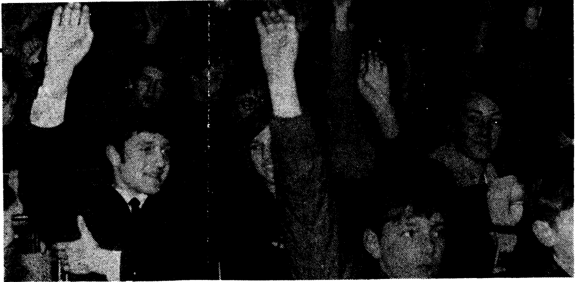
YOUNG SOCIALISTS IN ENGLAND VOTE AT ANNUAL MEETING FOR KEEP LEFT union movement.

Youth in America must not let the bosses and the government keep up profits at their expense, or fight in the imperialist wars. World capitalism is in crisis. The bosses can no longer maintain their profits without cutting down on expenses. In England this has been particularly evident. There has been a wage freeze on for over a year, speedups, growing unemployment, and more moves to break the power of the trade unions. As one Britisher states, "I've had 3 or 4 jobs in the last year alone. I joined the YS after coming to the Dec. 12 demonstration and lobby of parliament. The YS can put up a real fight against unemployment." A girl member of the Tailor and Garment Worker's Union saw the YS as a force that could change the present leadership in the trade