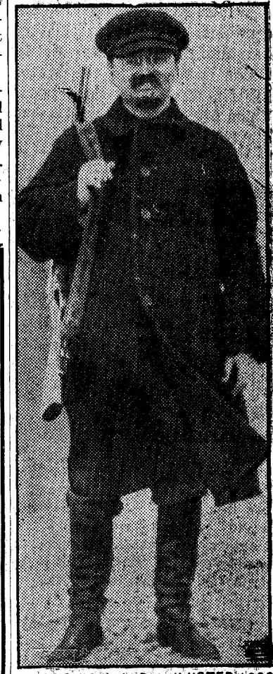
TROTSKY, WAR MINISTER 1924

The building of his world party, the continuation and development of his struggle through this party, is the greatest monument to Trotsky's memory. He would have wanted no other.