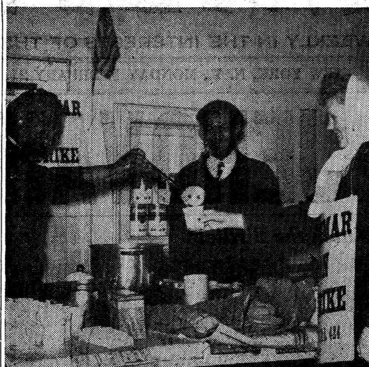
Scene at soup kitchen of strikers at the zipper manufacturing Conmar plant in Newark, N. J., which was shut down for two weeks until the company met the demands of the strikers, members of the CIO United Electrical Workers. The strike was supported by AFL machinists also employed in the plant.

University of Oklahoma. (These legislators evidently believe that if teachers with “intellectual commitments” have no place in the schools, then neither have students with such commitments.) The bill, now under consideration by the State Senate, would subject violators to a $500 fine and 10 days in jail.