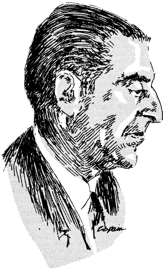
EDUARDO FREI MONTALVA

As noted at various times in World Outlook during the past year, the Cuban government has made some very cogent criticisms of the Frei regime in Chile, which is currently serving as a display case for the State Department in Latin America. The attitude of the Cuban government toward Frei was one of the main indicators in determining how false was the judgment offered by certain ultraleftists that the Tricontinental Conference in January 1966 marked a "turn to the right" for Castro.