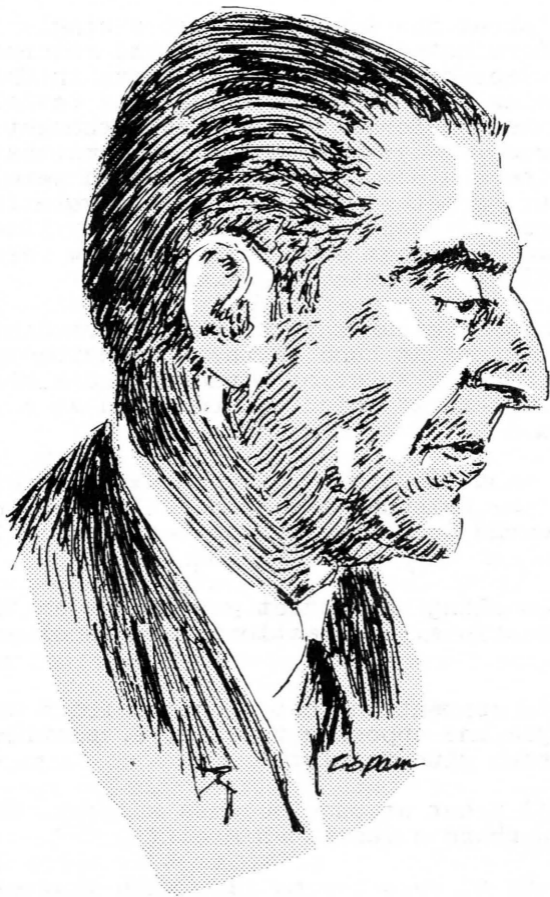
EDUARDO FREI MONTALVA