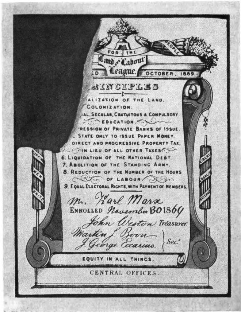
Karl Marx's membership card of the Land and Labour League