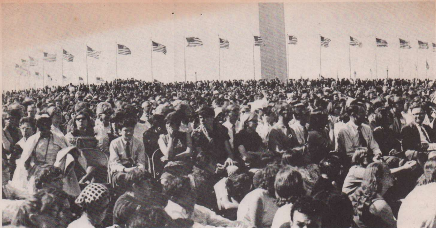
The March on Washington--April 17, 1965.