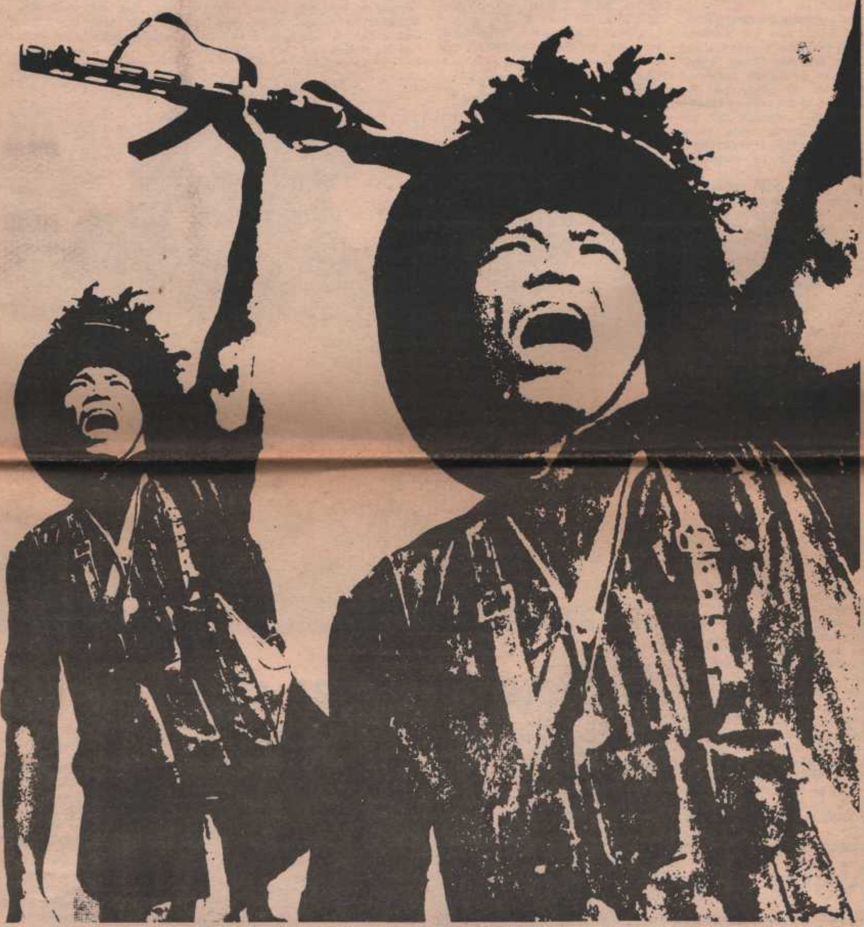
December 20 marks the 8th anniversary of the founding of the NLF. The NO is planning on issuing this picture as a poster. Revolutionaries are invited to show solidarity through appropriate actions.