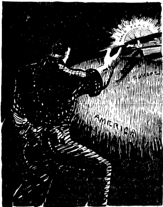
One Big Union