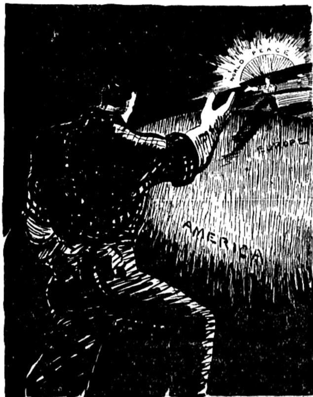
One Big Union

The merger of the two revolutionary parties will take place at a joint convention to be held in December. The combined body will form the largest Communist party in the world, with a membership of upwards of 2,000,000.