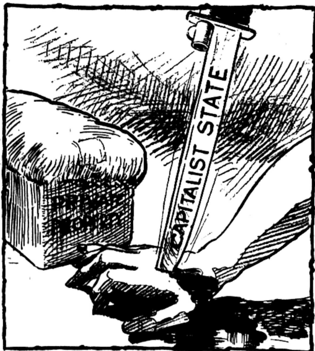
The Power That Protects

The Cooperative Movement has been long established in England, Belgium, Italy and Germany. Are the workers of those countries better