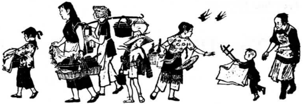
Preparing for the noon-day break in the countryside

China's water resources as a whole are more than sufficient to meet the needs of the country for irrigation, land reclamation, afforestation, animal husbandry, navigation and industry, but more than three-fourths of them are concentrated in the Yangtse River and areas south of it. By leading part of the Yangtse waters to the north this disparity in water resources will be remedied. It will also have the advantage of accelerating economic development, agriculture in particular, in the arid north and northwest.