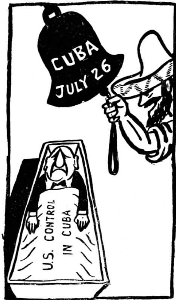
"For Whom the Bell Tolls"

Cuba's economic facts of life are clear. Sugar is the chief source of national income. But more than half of the sugar companies in the country are run by the U.S. monopolies. U.S. capital also controls half of the country's railways, one-third of the banks, most of the mining industries, public utilities and processing industries, and all of the power industry and postal and telecommunica-