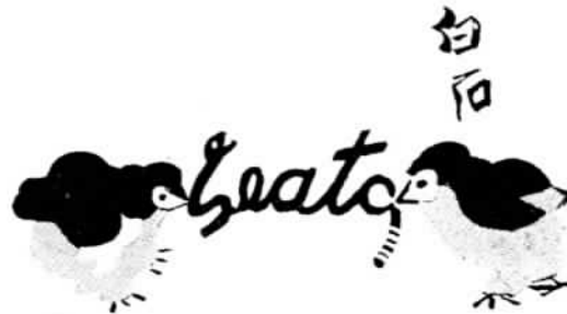
Two Chi Pai-shih chicks tearing SEATO