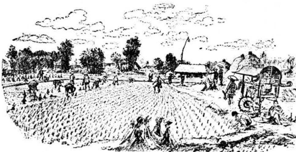
Reaping the ripe, planting the new

In urging the people's communes to develop their diversified farming so as to produce more and better raw materials for industry, Renmin Ribao , in its editorial dated July 29, pointed out that this will not only benefit the country's light industry and contribute to the improvement of the livelihood of the people as a whole, but add to the income of the people's communes as well. The