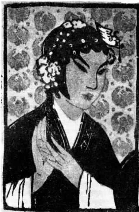
Peking opera actress

This was a theatrical kaleidoscope that reflected for its audiences many of the key episodes in the revolutionary struggles of the Chinese people over the past