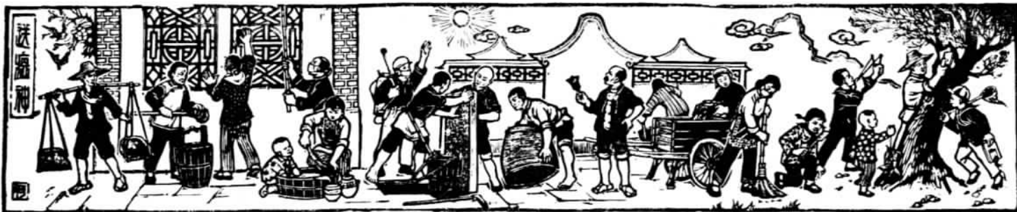
Away with the "God of Plague"