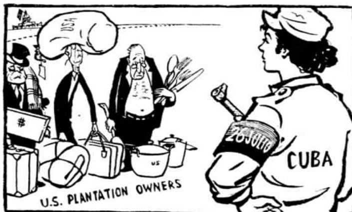
"About turn! Quick march!"

When the Cuban Government promulgated its land reform law in May, blatant diplomatic pressure was ap-