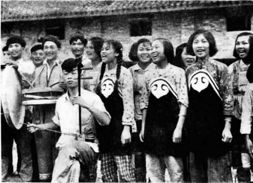
Student singers and dancers perform for the delegates of people's communes at Tuan

complain about my bad or even wrong accent and pronunciation. My wife has time and again remonstrated with me, saying: "You have been living in Peking for nearly ten years and yet your pronunciation still sounds terrible." My lame answer has always been that old dogs cannot learn new tricks. But unconvinced she says: "It's never too late to learn." This time, I felt quite upset.