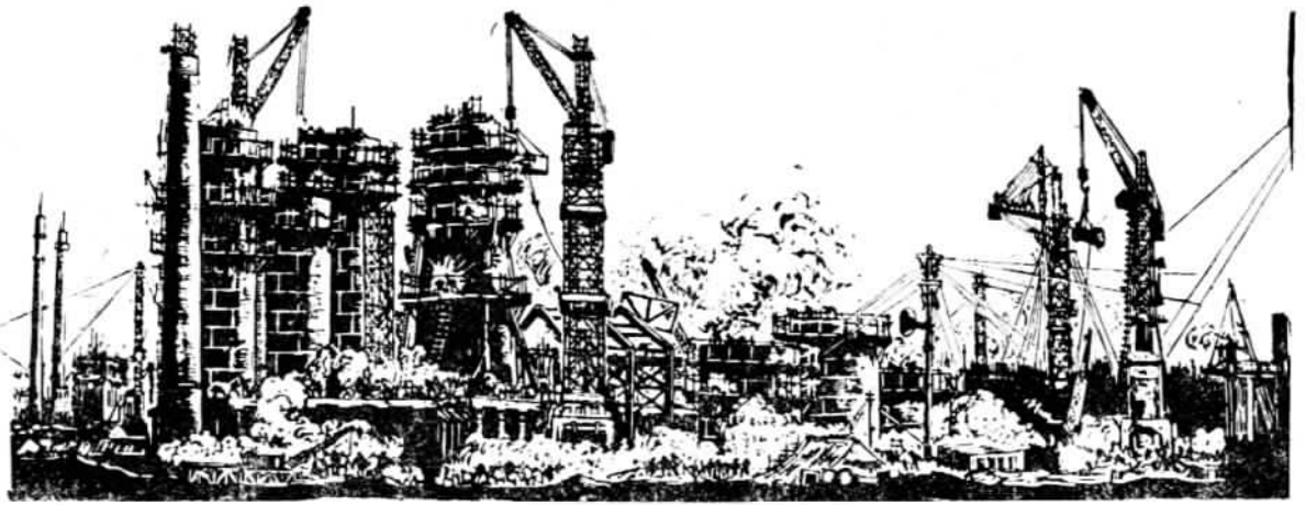
Building a Steel Plant

seven largest steel producers in the world turning out more than 10 million tons of the metal annually. The bourgeois press (e.g. the U.S. weekly Time ) has slandered China's mass effort for iron and steel as a "fiasco." If this be "fiasco," let's have more of it!