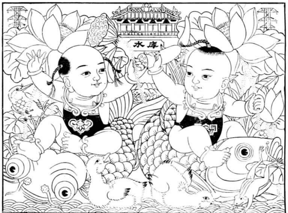
The Reservoir Is Good! (Outline printing in black before adding colours)

Visit to the Bottom of the Sea by Liang Li-ko is specially drawn for children. Done in poster colours in a style modelled