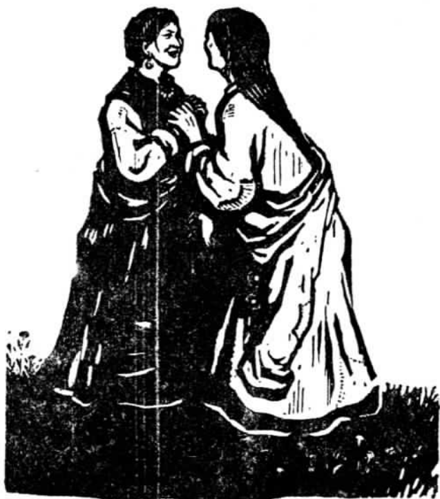
The Glad Tidings of Freedom