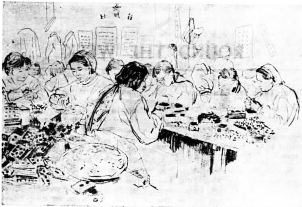
Housewife-Workers in a Community-Run Factory