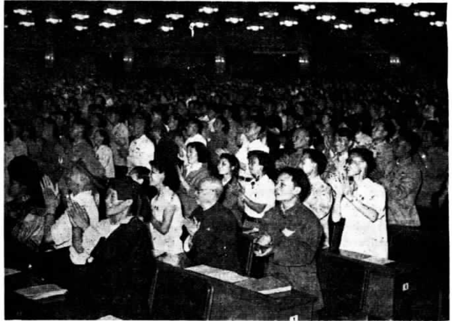
Delegates cheering leaders of the Party and the Government

tuals as its backbone has begun to be formed. The Central Committee of the Chinese Communist Party and the State Council of the People's Republic of China consider it necessary to call such a conference to commend the advanced, exchange experiences, strengthen unity, give revolutionary energy full play, so as to raise our country's cultural revolution to new heights in line with the big leap forward in our industrial and agricultural production, the people's commune movement in the countryside and cities and the movement for technical innovations and technical revolution, thus greatly promoting our socialist construction.