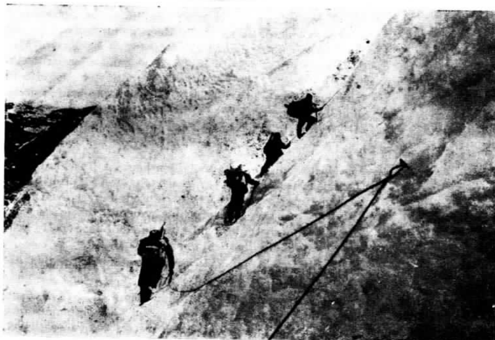
Near the North Col

Crossing a stretch of snow-covered ground under a slope, the climbers stopped short. A dark object lay by the route. It was the corpse of a man. Its shredded and faded green down garments were of British make. The corpse had stiffened and shrunk and the features were beyond identification. Owing to the cold the body had not completely decomposed. The indications seemed to show that it was the body of a British mountaineer who had died a score of years ago. Despite their exhaustion towards the end of their day's climb and the bitter weather, the climbers dug a grave in the snow and buried the corpse.