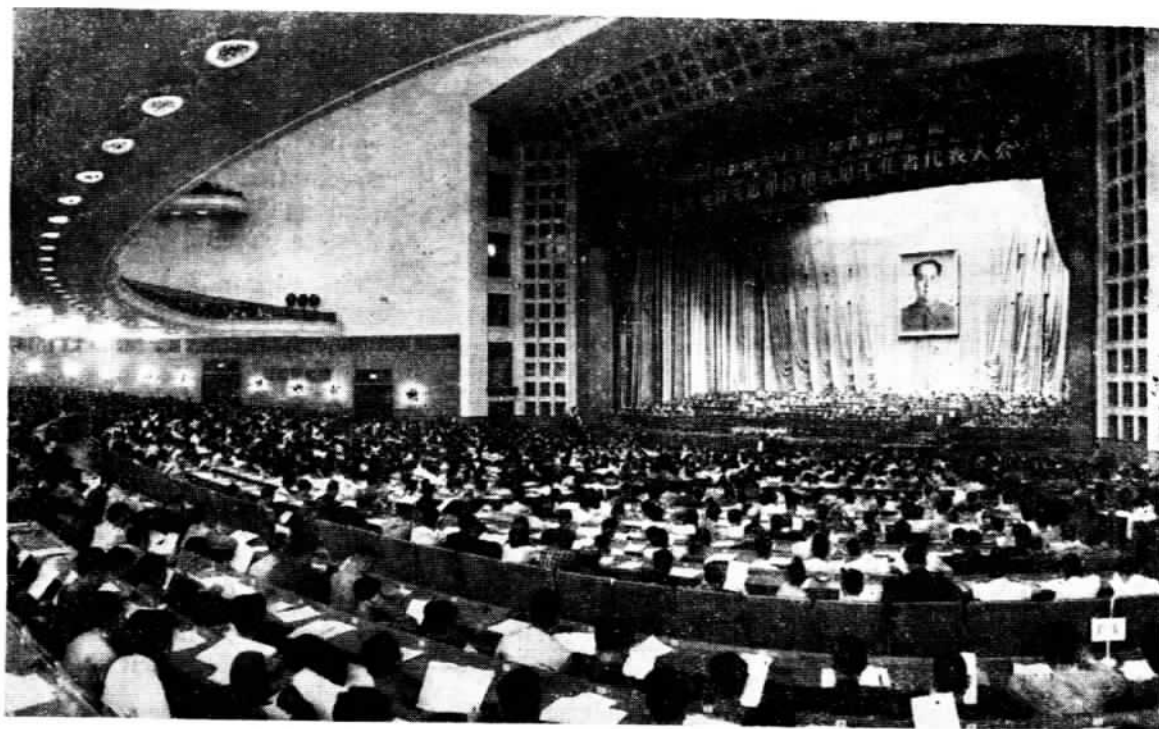
At the inaugural meeting of the Conference of Outstanding Groups and Workers in Culture and Education

The inaugural meeting also heard a report by Lin Feng, Member of the Central Committee of the Chinese Communist Party and Vice-Chairman of the National People's Congress Standing Committee. After reviewing the ten years' achievements in culture and education, he pointed out that the fundamental task is to carry to final victory the socialist revolution on the political and ideological fronts, to thoroughly eliminate bourgeois political and ideological influences, greatly enhance the communist consciousness and moral qualities of the whole