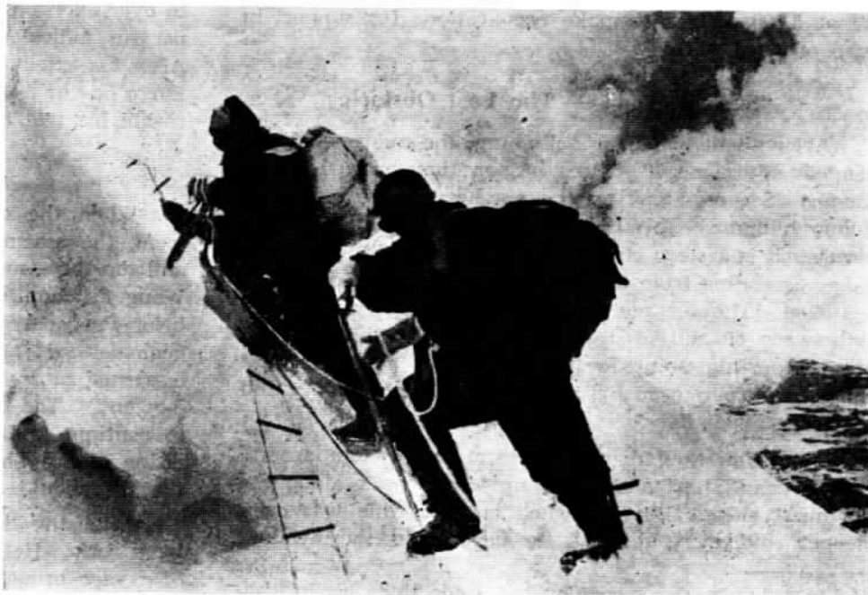
A ladder was used in climbing to North Col

They had a small cine-camera with them. But it was still too dark to take any shots. When they descended to 8,700 metres, it became lighter. They turned around and took a few shots.