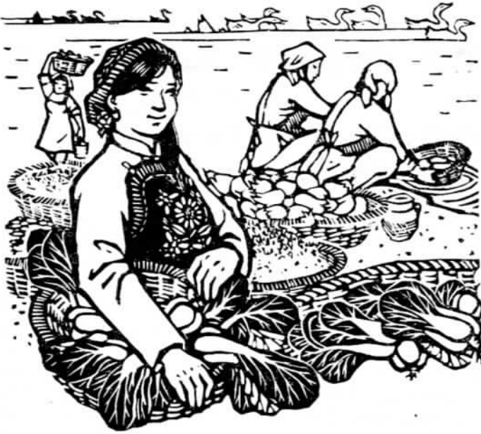
Fresh Vegetables from the Commune Woodcut by Yao Chen-huan

needed. One of them, led by its commanding officer, helped local communes dig nearly 200 irrigation canals and ditches in three days. Units stationed along the Yangtse River have also been helping with the hoeing and weeding and planting of late autumn crops.