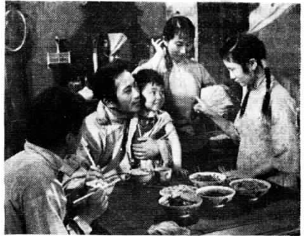
"A Revolutionary Family"

This film released in January and still running to packed houses is such a tremendous hit that one reviewer referred to it as signalling kaimenhong in the cinema arts in 1961.