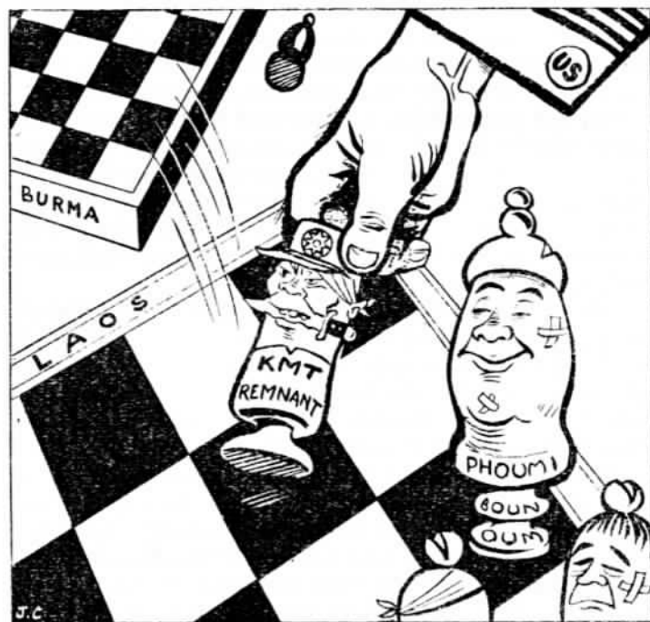
Moving the Pawn

That the Kuomintang bandits have infiltrated Laos in large numbers is no accident. It is part of U.S. imperialism's aggressive scheme to subvert the Phouma government of the Kingdom of Laos. Chen Pao , a Kuomintang daily in Hongkong, disclosed early in January 1961 that high-ranking officers of the Kuomintang brigands flew to the lair of these remnant bandits last December and drew up a plan for the dispatch of "an