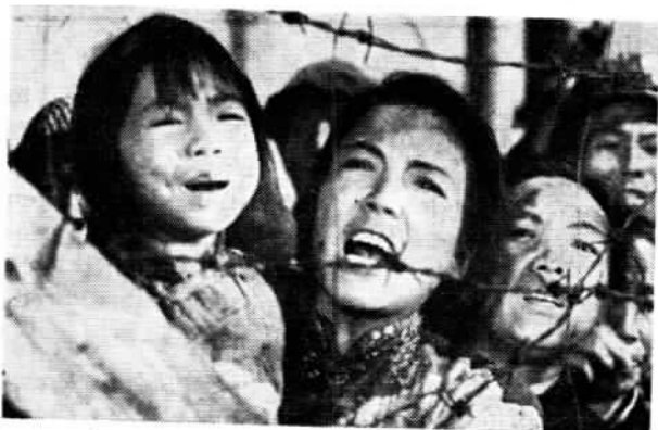
A scene from "Our World Has Changed"

Red Guards of Lake Hunghu and A Revolutionary Family are but two outstanding examples of the rich 1960 crop of films aimed at educating the people in our revolutionary tradition.