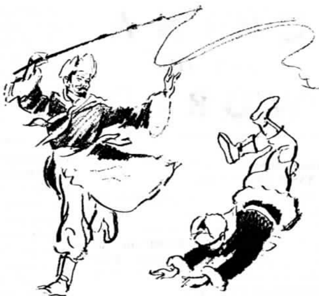
"The Gay Grain Transport Team"

Peking Commemorates Ukrainian Poet. The centenary of the death of Taras Shevchenko, great Ukrainian people's poet and revolutionary democrat, was marked in Peking on March 10 at a gathering of over 1,500 people.