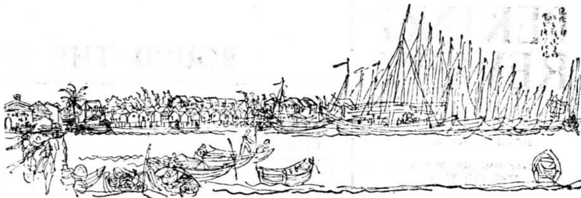
In a South China Fishing Port

The big leap in the country's engineering and steel industries brought about a rapid rise in the output of farm machinery. Irrigation and drainage equipment in the countryside has increased some ninefold in the past three years with three times as many tractors now in use on the farms. Although farm machinery does not yet play a leading role in the country's agricultural production its effect is being increasingly felt. As China's industrialization proceeds and more machines roll off its assembly lines the future will witness the