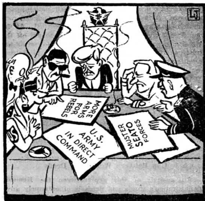
Kennedy's "Settlement" of the Laotian Question at the "Conference Table"

Now let us turn to Asia. Kennedy has declared that he "respects and values the position of those countries who want to be neutral." The tone is indeed somewhat different from that of the late notorious U.S. Secretary of State Dulles who attacked neutrality as an "immoral conception." But people can get a very clear idea from the Laotian question as to how Kennedy "respects" and "values" the position of neutral countries. The U.S. Government, during Eisenhower's term of office, twice subverted the Souvanna Phouma government which pursued a policy of peace, neutrality and national amity,