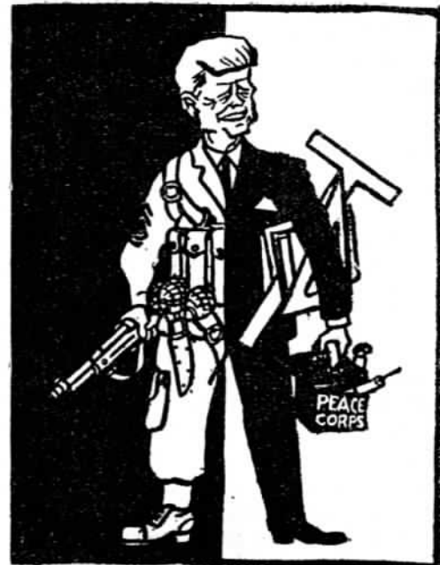
The Kennedy Style — "Peace Corps" Uniform Cartoon by Chiang Yu-sheng

L'Express of France on April 20 published an article by the noted French bourgeois writer Jean-Paul Sartre,