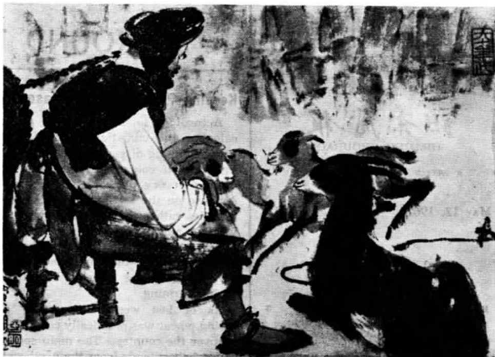
Shepherd and Sheep

This nationwide movement which mobilized the Chinese people against