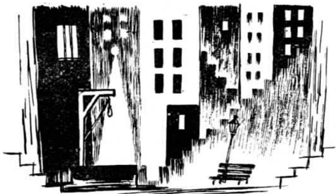
Set for the final scene of "The Centre Forward Dies at Dawn" at the Youth Art Theatre