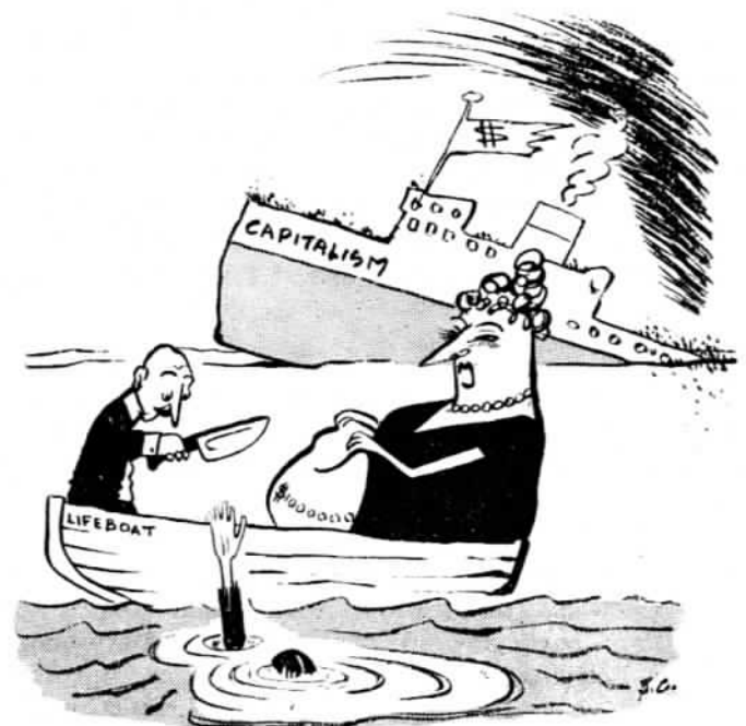
“Cut off his fingers, Hiram. He’s rocking the boat!”

The man-hating ethic, so intensively propagated by the get-rich-quick-at-all-costs capitalism of these United States, is now turning on itself to destroy its own children.