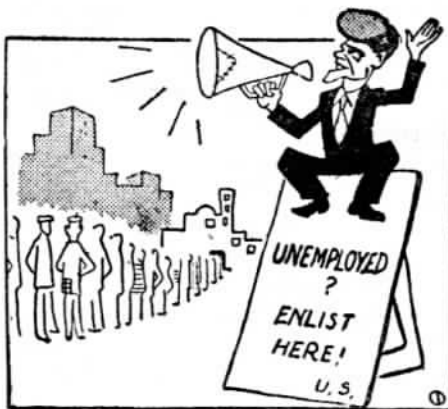
More Opportunities for "Employment"