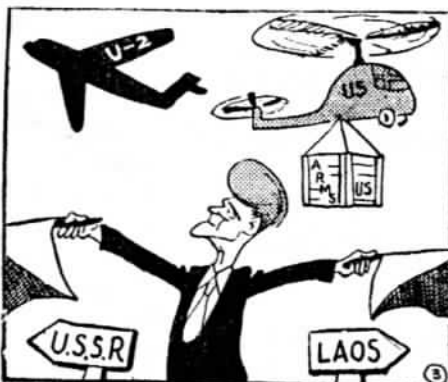
"Transport" Is Busier Than Ever