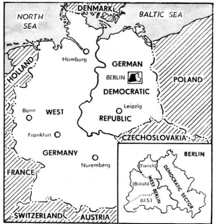
Sketch Map by Su Li

The need to conclude a German peace treaty: The Western powers, the United States and the Bonn revanchists in particular, are raising a hue and cry about the West Berlin question both to cover up the foul situation we have just described and to divert world attention from the present urgent need for the signing of a German peace treaty.