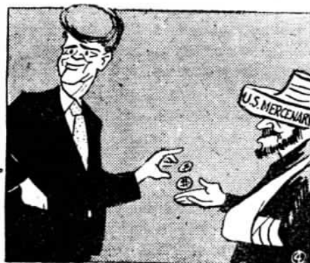
"Aid for the Needy"