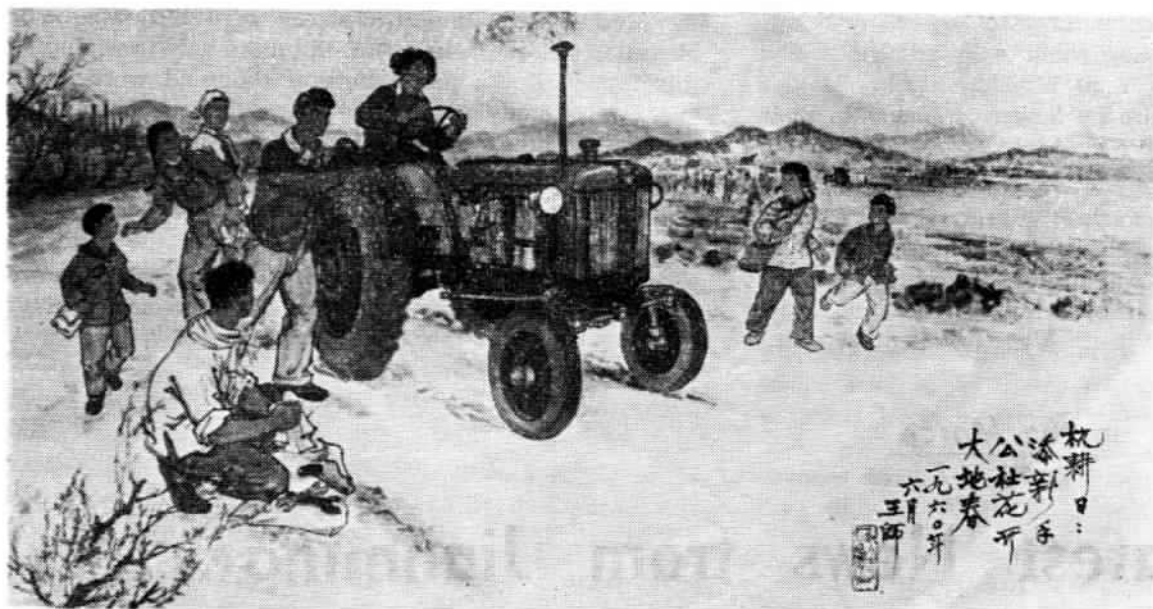
The Commune's New Driver