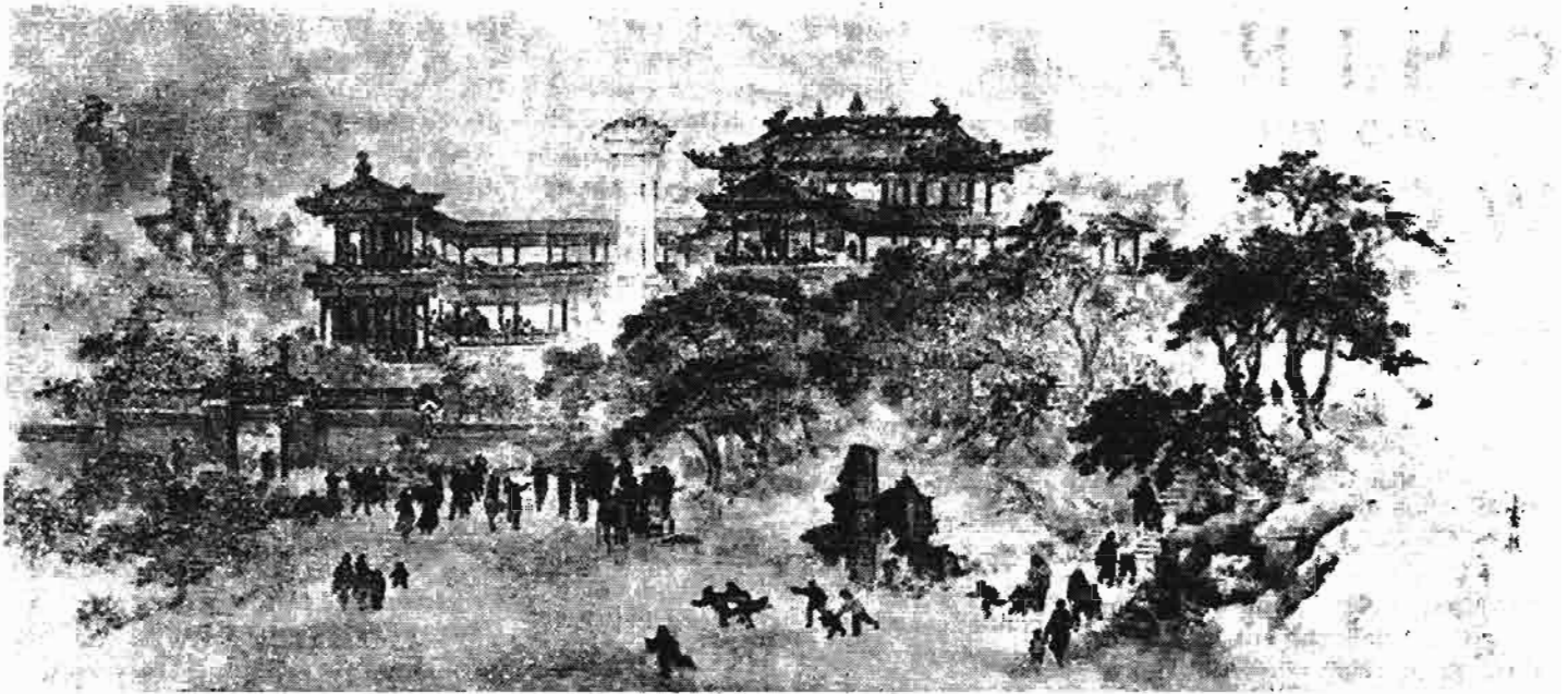
Park in Spring Time