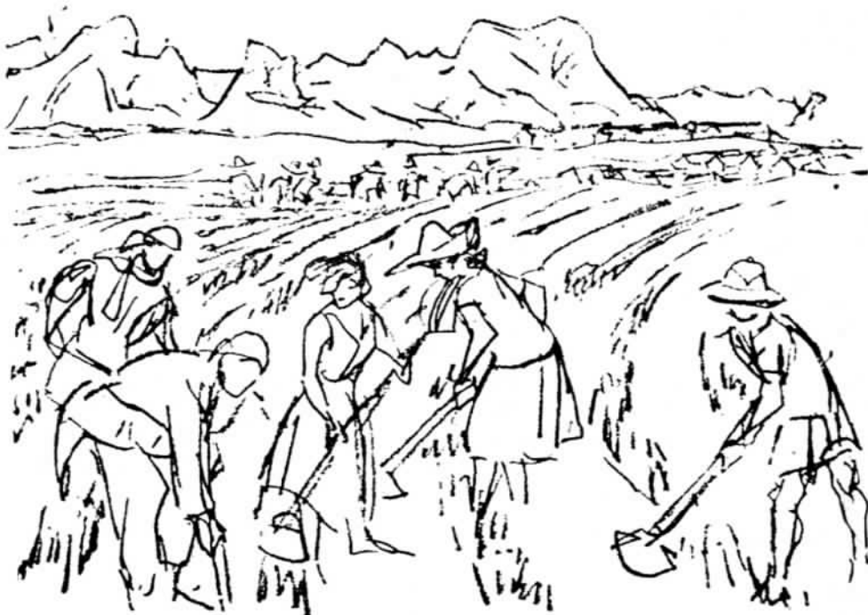
Returned overseas Chinese at work on their farm

This sent my memory back 40 years when a typhoon hit the Chaochow and Swatow areas. As the then government had made no preparations at all in advance, the people suffered terrible losses. No less than 29,000 people died and the death toll in the city of Swatow alone amounted to more than 2,000. After the disaster I was made one of the leading figures in the Office of Rehabilitation, but the corrupt warlord government showed not the slightest concern for the people and some unscrupulous officials even filled their own pockets in the name of relief. The work of rehabilitation went on for years, but it took years for production to recover. In 1947, two years before liberation, another typhoon less strong than last year's hit Swatow but more than 10,000 people were made home-