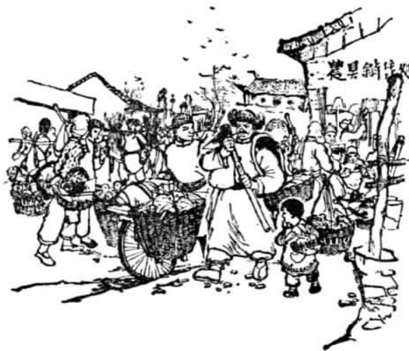
A scene at the fair

Travels of a Magician , is China's first full-length stereoscopic feature. The magician's son who shows his father, recently returned from abroad, the miraculous changes in post-liberation Shanghai is played by the noted screen comedian Han Fei. Another film, showing very amusingly the changed status of women in the countryside is Li Shuang-shuang . The country wife who gives the film its name is an energetic woman active in public affairs. She does her best to change the