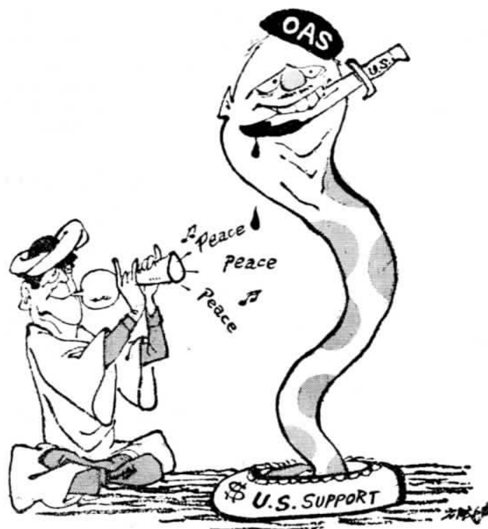
The Snake Charmer

The "O.A.S." has close links with fascist organizations in the imperialist countries of Western Europe. Not long ago, Salan went to Belgium, Switzerland and West Germany to enlist support. At the time of the "Petain government," he was an agent of Hitler's military intelligence service. Today he has established connections with the West German espionage organization headed by Ghelen and has set up six recruiting stations in West Germany. The "O.A.S." has printing works and arms