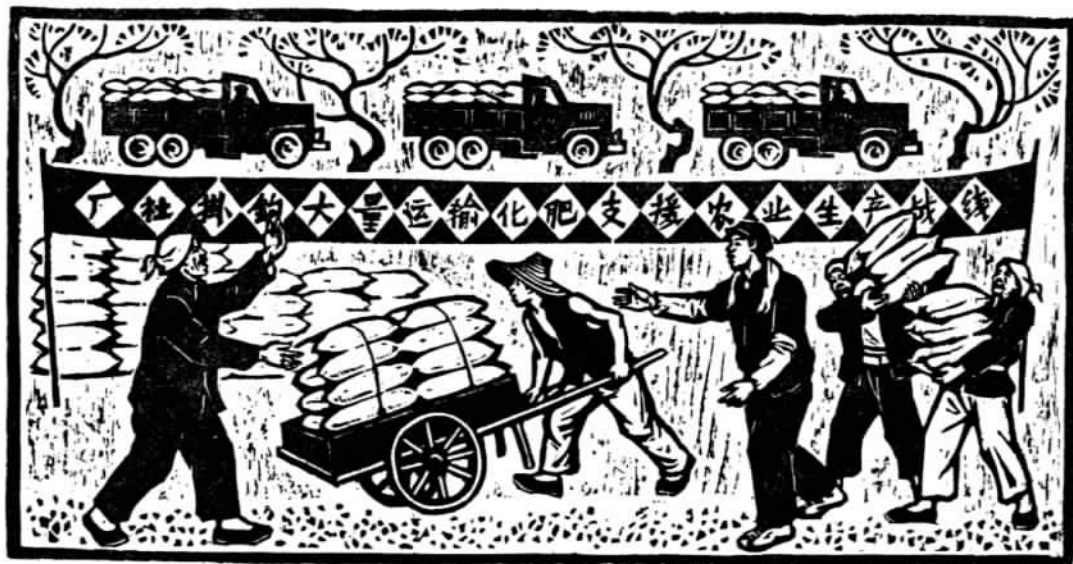
Chemical Fertilizers for the Farms