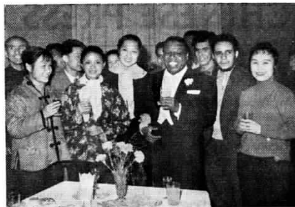
The Cuban Negro singer Ignacio Vila Fernandez (Bola de Nieve) with Chinese artist friends at the farewell party given in his honour in Peking. He gave his final performance in China on April 6 before a packed house. Premier Chou En-lai and Vice-Premier Chen Yi were in the audience