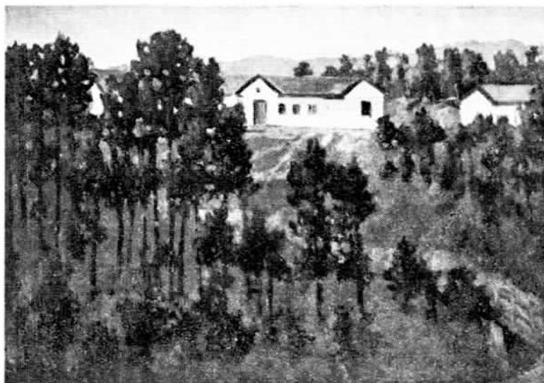
Oil painting by Yu Pen

The laboratory staff has collected many folk prescriptions and methods for treating snake bites. These are being systematically tested so as to establish, improve or disprove their clinical usefulness. Very promising therapeutic agents have been derived or developed from these "home" remedies.