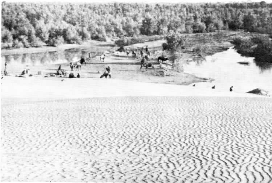
Tarim Basin oasis

Everything seemed ready; then again the unexpected happened. The weight of the baskets on the "rope bridge" finally dragged the tractor on the southern dam into the water. The "rope bridge" sagged. Chung immediately sent for an 80 h.p. tractor as reinforcement. But, as ill luck would have it, there was not a single heavy tractor on the southern bank. To get one over from the northern bank two of the small wooden barges, which were all the boats available at that point, were lashed together and the tractor-driver slowly moved his giant machine onto them. They sank rather low, but by careful handling they were brought over without mishap. To the anxious watchers on