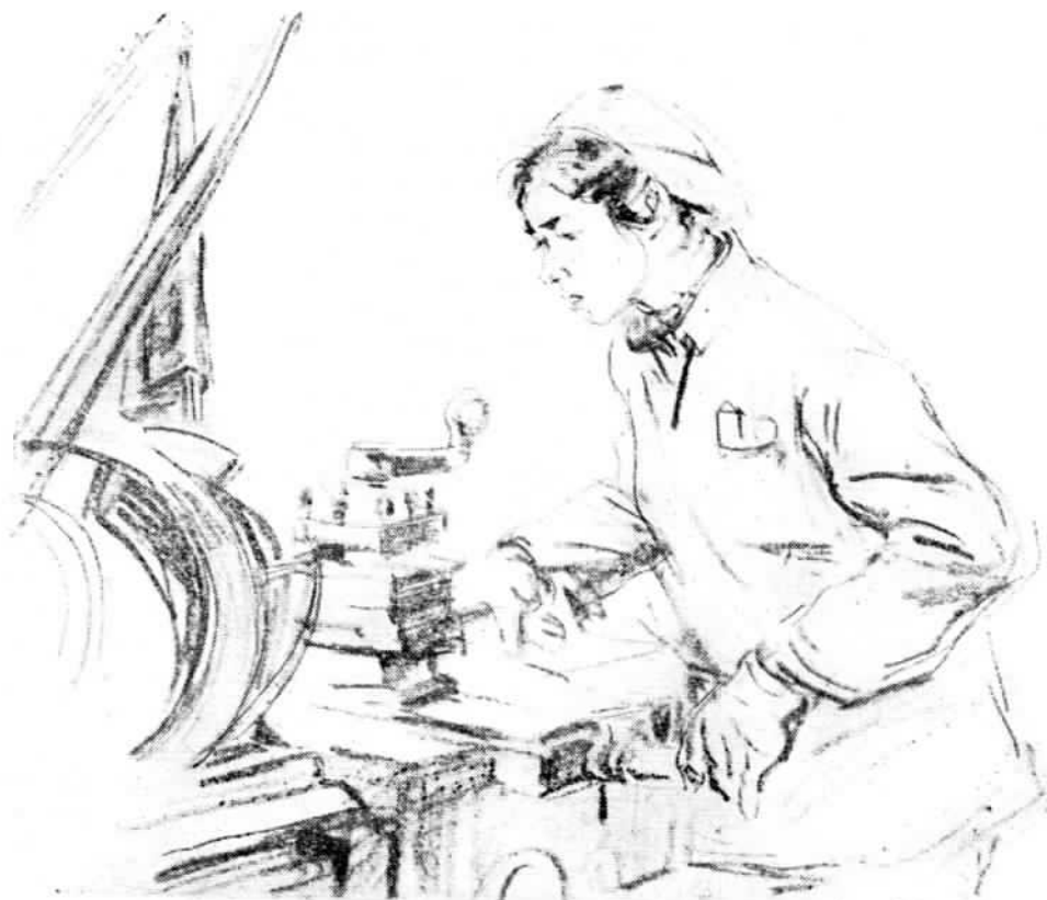
Sketch by Chiang Wen-ping

The real history of China's textile machine-building industry began only after liberation. The People's Government took over a number of textile machinery repair and assembly factories owned by bureaucrat-capital, expanded and retooled them and gradually developed them into a more or less comprehensive textile machine-building industry. Among the factories taken over was this Jing-