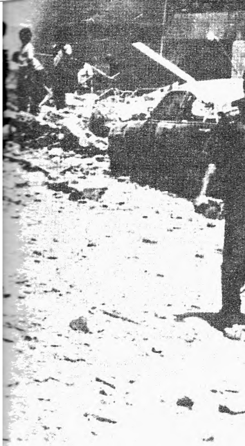
The civil war in Lebanon and Israeli aggressions are part of a Yankee plan to strike at the Palestinian Revolution.

were clear affirmations on the right of the Palestinian people to self-determination, to return to their homeland and to establish an independent state — in essence the total acceptance of the Palestinian revolution's 10-point program. This fact is even more important since we Palestinians know that this program was totally rejected, not only by Israel and imperialism, but also by all the reactionary Arab states. Two months earlier Carter had declared that the Arab countries were opposed to the creation of an independent Palestinian state, which was true in terms of the reactionary countries.