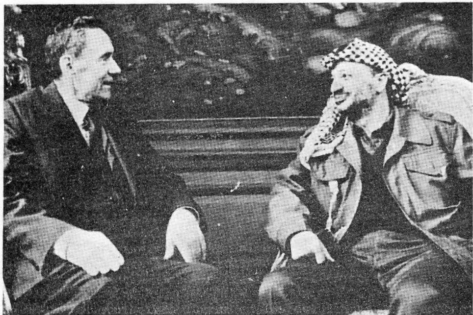
Palestinian leader Yasser Arafat was received in the USSR by Andrei Gromyko as a show of solidarity with the Palestinian cause.

sent at that time by Soviet leaders to President Suleiman Franjeh, reaffirming the Soviet Union's interest in the progress of the Palestinian revolution.