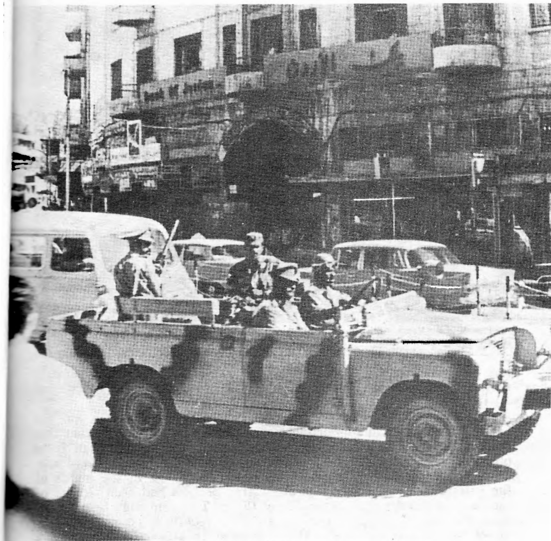
A military patrol in Jordan during the period in 1970 known as "Black September."

As I said, from this visit we learned that to obtain more support from our friends, we had to fight more, be clearer politically, and develop a very strong anti-imperialist and antireactionary struggle not only in our program, but also in practice.