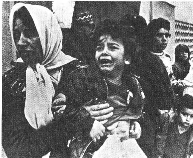
People of the southern suburbs - living under Phalangist threat, Dec. 1983

fend Lebanon as an independent Arab state in the face of Israel and its imperialist backers, or there will be no army in Lebanon. Without this task for the army, there is no need to have an army; the internal security forces are better than the army in preserving internal security. We want an army that agrees with Syria and the Palestinian revolution on confronting the Israeli occupation and the danger of US aggression, not an army that fights Syria and the Palestinian revolution with US and Israeli support.